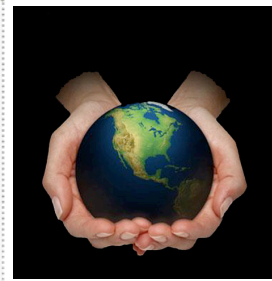
We only have one earth.

You can accomplish anything you put your mind to.